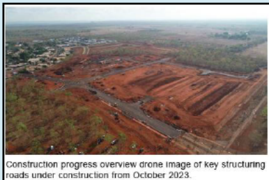
Construction progress overview drone image of key structuring roads under construction from October 2023.

There is potential for the broader Katherine East area to deliver a further 600 dwellings, which accounts for approximately 40 years supply at current baseline take-up rates. It is anticipated that the provision of key strategic urban amenity elements will help foster the delivery of these dwellings in a greater variety of forms.