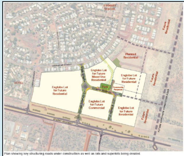
Plan showing key structuring roads under construction as well as lots and superlots being created.