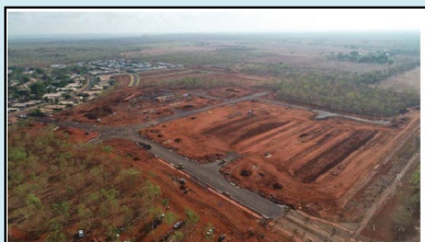
Construction progress overview drone image of key structuring roads under construction from October 2023.

There is potential for the broader Katherine East area to deliver a further 600 dwellings, which accounts for approximately 40 years supply at current baseline take-up rates. It is anticipated that the provision of key strategic urban amenity elements will help foster the delivery of these dwellings in a greater variety of forms.