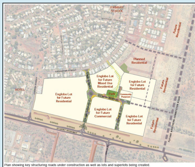
Plan showing key structuring roads under construction as well as lots and superlots being created.