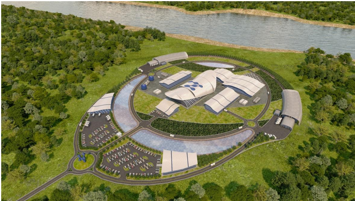
Image: NuScale Power SMR, 12 x 77 MWe modules, 924 MWe total on an 18 hectare site. US Nuclear Regulatory Commission (NRC) Final Safety Evaluation Report issued in August 2020 - first SMR to achieve NRC design approval.