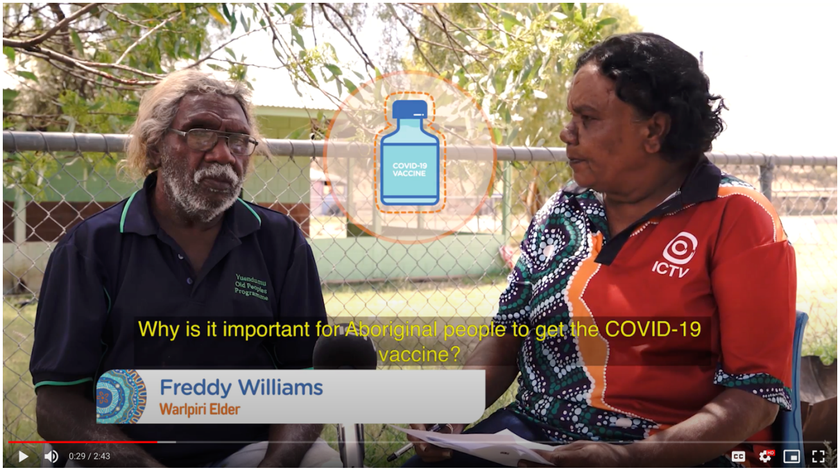
Screen image from ICTV vaccine campaign, November 2021