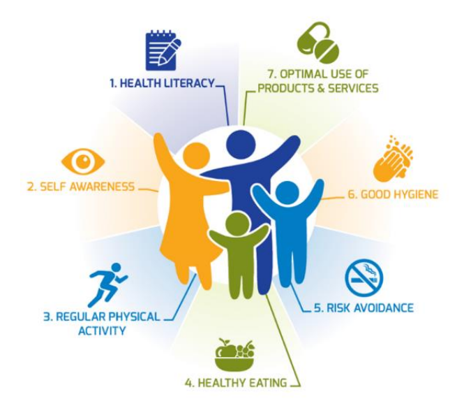
Figure 1 – the seven pillars of self-care

Recent economic modelling<sup>12</sup> reveals that greater self-care has the potential to save Australia's healthcare system between $1,300-$7,515 per hospital patient, per year, and significantly lower hospital readmission rates<sup>13</sup>.