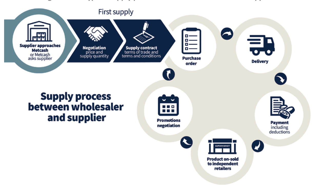
Figure 2.4 – Typical supply process between wholesaler and supplier