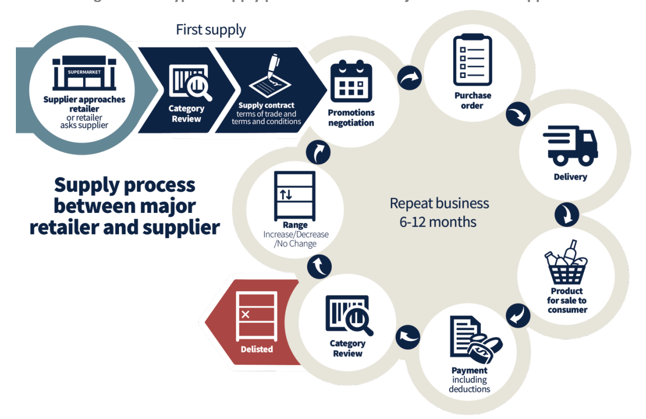
Figure 2.2 – Typical supply process between major retailer and supplier

Coles and Woolworths have implemented these systems to remain responsive to their customer's changing expectations. Commercial flexibility is a key concern that must be balanced against the expectations of suppliers, who need a degree of certainty to be able to invest and plan for their business.