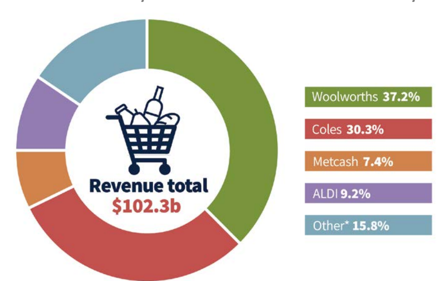
Figure 2.1: Food and Grocery Retail Sector Market Share for financial year 2017–18

The supermarket and grocery industry in Australia is highly competitive, yet concentrated. The four largest businesses, Woolworths, Coles, ALDI and Metcash Ltd (Metcash) make up over 80 per cent of industry revenue, with the two major supermarkets, Woolworths and Coles, holding over 65 per cent of the market combined (Chart 1.1).<sup>4</sup>