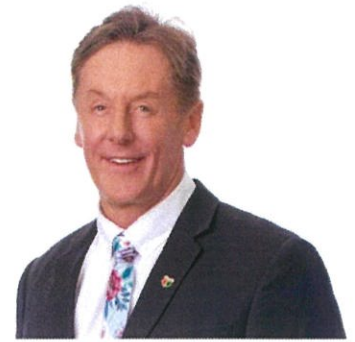
Mayor Darren Power City of Logan

Please Quote File: 1037350-1 Document Reference: 14339056