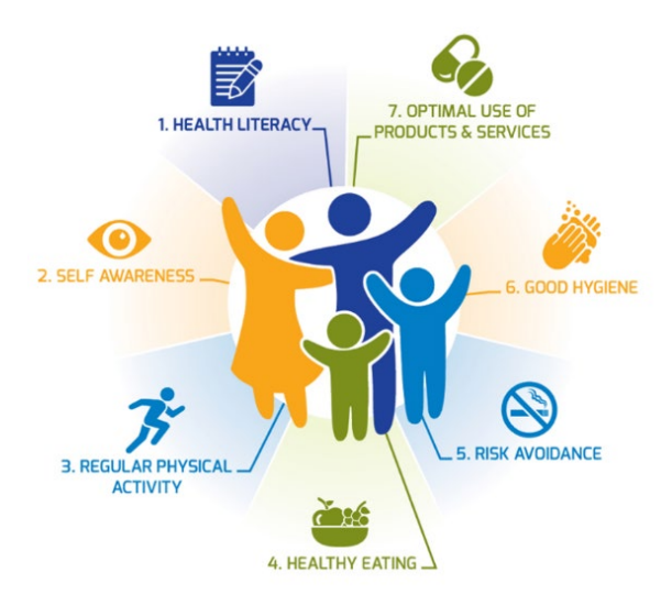
Figure 1 – the seven pillars of self-care

Self-care refers to the activities we can undertake every day to enhance our health and wellbeing, prevent disease, limit illness, and use health care services effectively ( Figure 1 ), and can assist policymakers and healthcare professionals to engage Australians in the proactive management of their health.