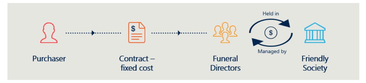
Figure 1 | Buying Prepaid Funerals