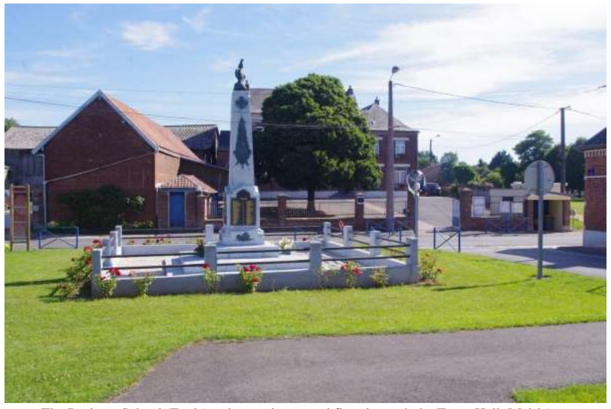
The Pozieres School (Ecole) today on the ground floor beneath the Town Hall (Mairie)

It is proposed the primary school be built on 5000 square metres of land already allocated by the Pozières Council.