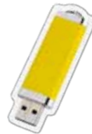
USB Flash Drives

The Australian Government is helping you with the costs of educating your kids. The Education Tax Refund provides up to 50% back on a range of children's education expenses. Refunds may be as much as $397 for every child at primary school, and up to $794 for every child at secondary school.