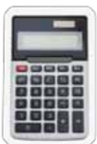
Associated Learning Materials

Remember to keep your receipts for tax time.