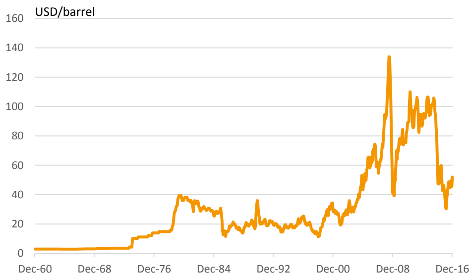
Figure 1: Spot crude oil price, West Texas Intermediate